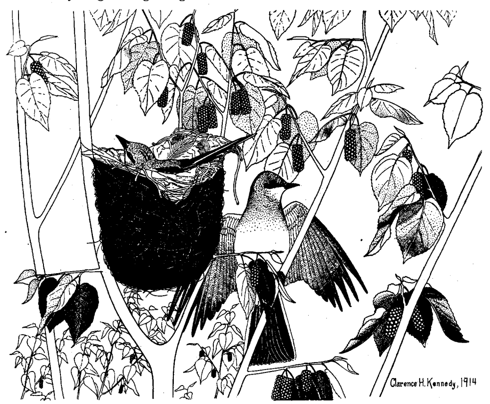
Fig. 20. An Arkansas Kingbird's nest in an old nest of the Bullock Oriole

ing haying, and two in mulberry trees. These were the lowest nests found, one being only eight feet off the ground, while the other eleven ranged from twenty to forty feet up. Also one of this last two was built in a last season's Oriole nest. Such a site is recorded by Dawson in his "Birds of Washington". This nest is shown in figure 20. The new material of stems, hair, wool and feathers put in by the new tenants made a striking contrast to the blackened exterior of the old nest. This nest contained but one young bird, less than a week old. As mentioned previously, a violent storm had passed over this region the week before, and this nest, made too shallow by recent padding of the Kingbirds, saddled as it was to a slender upright branch, had evidently dumped the other young during the gale.