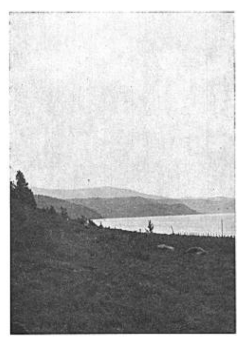
Fig. 22. NEAR SCHULER, AT THE NORTH END OF EAGLE LAKE. THE REGION HERE IS BUT SPARSELY TIMBERED, IN STRIKING CONTRAST TO THE CONDITIONS AT THE LOWER END OF THE LAKE

URING the past season's work afield (1914) Chase Littlejohn and the writer traveled something over a thousand miles. One of the many side trips taken was from Susanville to Eagle Lake and back, in company