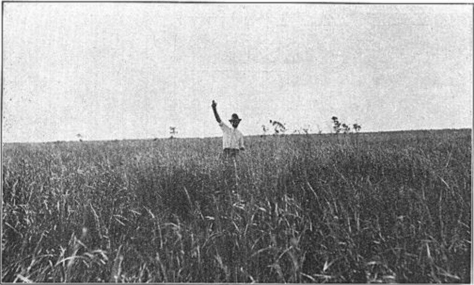
Fig. 1. AT THE NEST OF THE LOUISIANA CLAPPER RAIL IN A MARSH NEAR HOUSTON, TEXAS. THE FEW SCRUBBY PERSIMMON TREES IN THE BACKGROUND FORM THE ONLY SHELTER FOR MILES.

June 6 found me in the same region, about six miles south of Houston, searching the marshes and ponds for nests of the Least Bittern and Purple Gallinule. On the 30th I had been quite successful, for had I not located a nest of each containing five eggs? In the enthusiasm of the new discoveries I laid