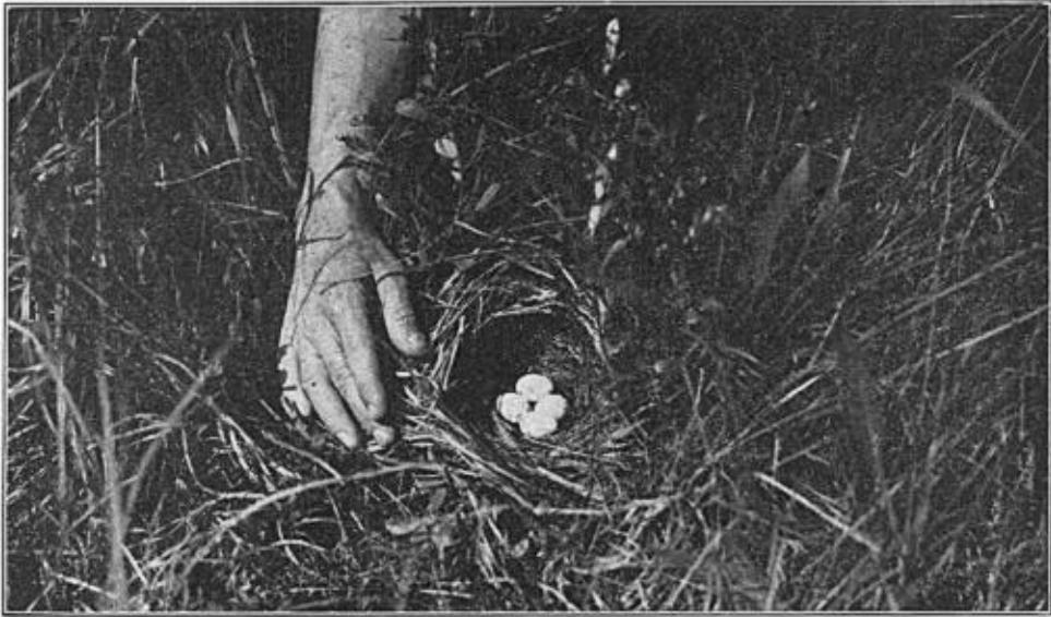
Fig. 4. NEST AND EGGS OF THE SOUTHERN MEADOWLARK, PHOTOGRAPHED NEAR HOUSTON, TEXAS, JUNE 11, 1914