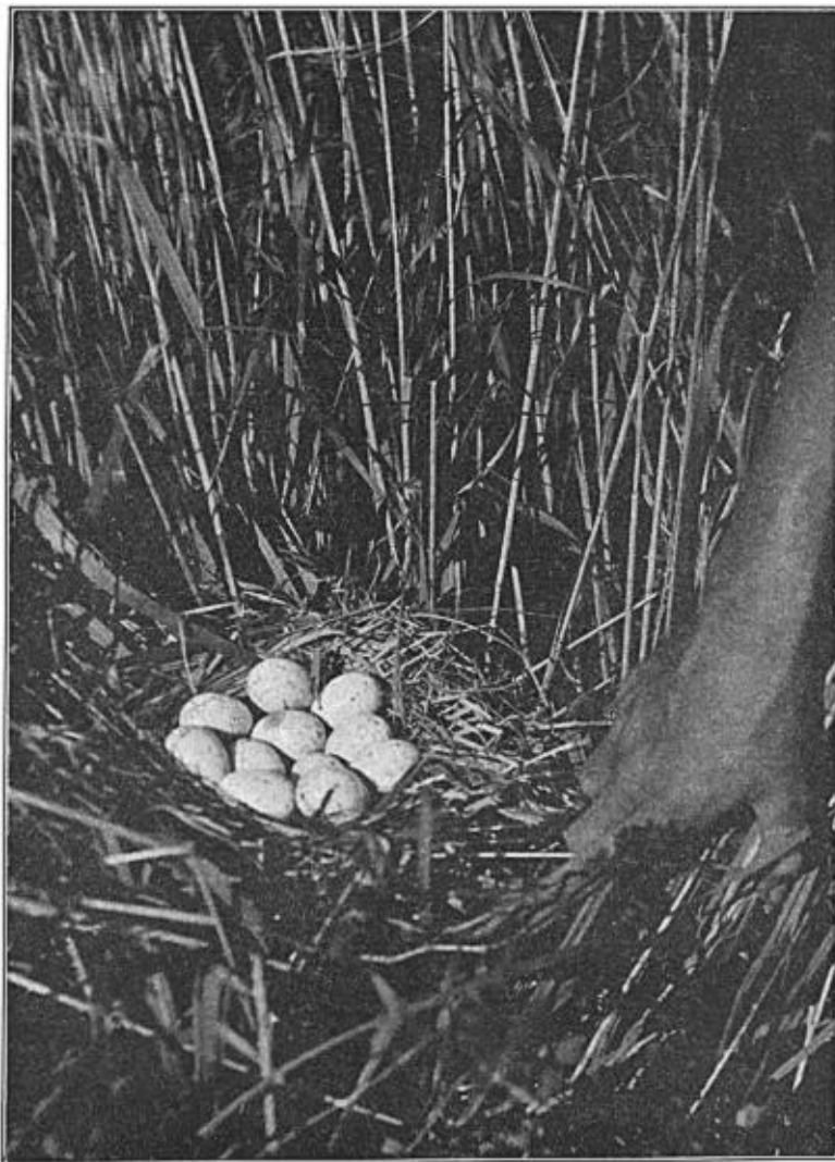
Fig. 3. ANOTHER VIEW OF THE NEST OF THE LOUISIANA CLAPPER RAIL, SHOWING DETAIL OF CONSTRUCTION

with comparative ease I would take them home with me; otherwise I would take the chance of the bird returning to them by leaving them in the nest. Picking one up, and hooking my thumb and forefinger about it, I placed it to my eye; with the sunlight on the opposite side I could note that incubation was advanced.