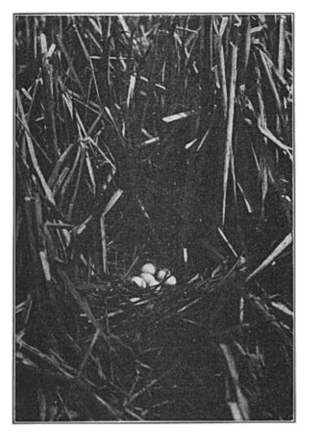
Fig. 71. NEST OF THE SNOWY HERON; BEAR RIVER, UTAH, MAY 1, 1910

The following morning we went by team to the outskirts of the marshes,