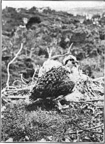
Fig. 64. YOUNG OSPREY, SAN MARTIN ISLAND, LOWER CALIFORNIA

we figured about 1,800,000 birds, as the population of the island. The gulls were not considered in this estimate, as their young were too scattered and the nests too hard to locate.