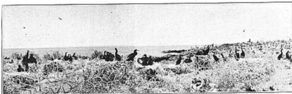
Fig. 61. PORTION OF FARALLON CORMORANT ROOKERY ON SAN MARTIN ISLAND, LOWER CALIFORNIA

At about seven-thirty a stream began to return, each individual heavily laden with fish. The ribbon of birds was now double—one part leaving and the