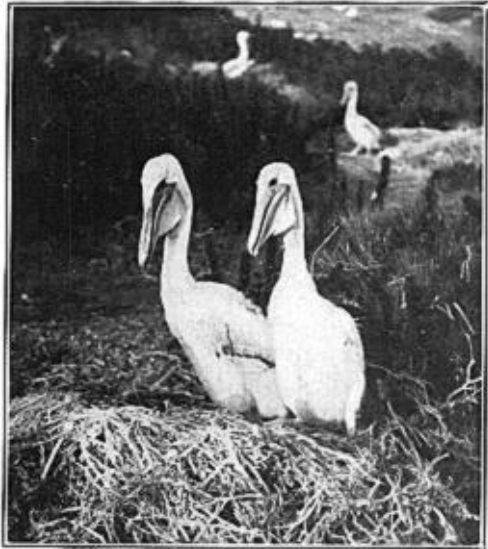
Fig. 63. YOUNG CALIFORNIA BROWN PELICANS, ON SAN MARTIN ISLAND, LOWER CALIFORNIA.

Allowing, then, one nest to every 100 square feet, we would have 348,480 nests included in the inhabited area. Each nest represented, on an average, three young and two adults. We found two young sometimes, but also found many more nests with four young. Allowing three young and two adults to each nest,