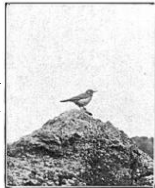
Fig. 65. ROCK WREN, SAN MARTIN ISLAND, LOWER CALIFORNIA.

Phalacrocorax penicillatus. Brandt Cormorant. Present in large numbers, though