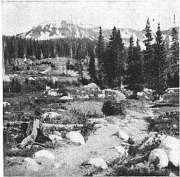
Fig. 33. HABITAT OF THE ROCKY MOUNTAIN PINE GROSBEAK, IN THE WASATCH MOUNTAINS, UTAH

my eyes instantly rested on a female Grosbeak sitting on a branch of a dead aspen. Apparently it was their trysting place, for almost at the same moment, the male appeared from somewhere alighting on the same branch some eight feet from the female who squatted with outspread wings and tail, in much the manner of young but fledged birds when being fed by their parents. Both birds commenced and kept up a continual twitter, the male strutting to and fro on the branch, each time drawing a little nearer to the female, and the while making obeisance, bowing the head as low as the feet, and displaying his colors with much grace, until they finally met. The female had not moved since alighting, other than the continued trembling of spread tail and fluttering wings. The male then rubbed his head and neck against the head and neck of the female, several times up and down, then suddenly with open beak she raised her head, the male seizing her by the beak, the two commenced tugging and pulling at each other. The stroking of necks and tugging of open bill of female was gone through with three times,