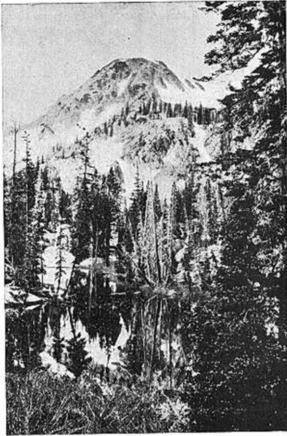
Fig. 34. LOOKING TOWARD THE 11,000 FOOT DIVIDE, WASATCH MOUNTAINS, UTAH; HOME OF THE ROCKY MOUNTAIN PINE GROSBREAK

always with much chattering; then coition; then with continued actions of endearment the male worked himself back to his original position on the limb, some six or more feet away, only to recommence his advances. Three times these actions were performed, then without warning both birds assumed a normal attitude and went as they had come, in opposite directions, the male into the dense conifers about two rods away, disappearing completely, while the female flew high over the tops of the trees fully an eighth of a mile and down to a lower altitude. Neither bird was seen again this day although diligently searched for; nor was there anything in their actions that would indicate that they had a nest