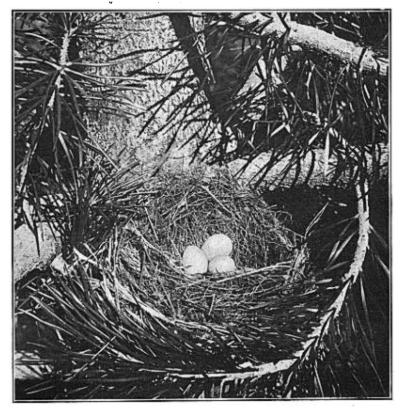
Fig. 60. NEST AND EGGS OF SIERRA HERMIT THRUSH IN LODGE-POLE PINE

The Sierra Junco shows a decided preference for the margin of meadow lands and often selects situations where the nests become water-soaked and the