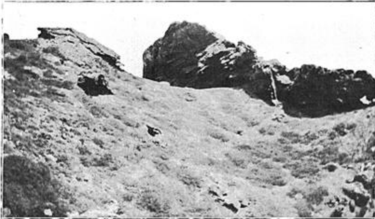
Fig. 16. MIDDLE ISLAND, LOS CORONADOS, SHOWING AREA OCCUPIED BY PETRELS

My first impression of the two middle islands, where most of these observations were taken, was unfavorable. Devoid of vegetation around the sides except for a spot here and there of scrub ice plant or wind blown cactus, they appear barren and desolate. By the time Petrels are ready to lay the Brandt Cormorants ( Phalacrocorax penicillatus ) and Western Gulls ( Larus occidentalis ), which make their homes on the rocks, are deserting their summer homes. Skirting the outlying rocks, an occasional fitting Coronado Song Sparrow ( Melospiza m. coronatorum )