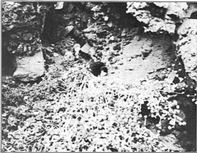
Fig. 57. YOUNG XANTUS MURRELET BELOW NESTING BURROW

The old birds not engaged in incubation spend the entire day at sea and are not to be seen near the islands. These return after dark, when their mates leave