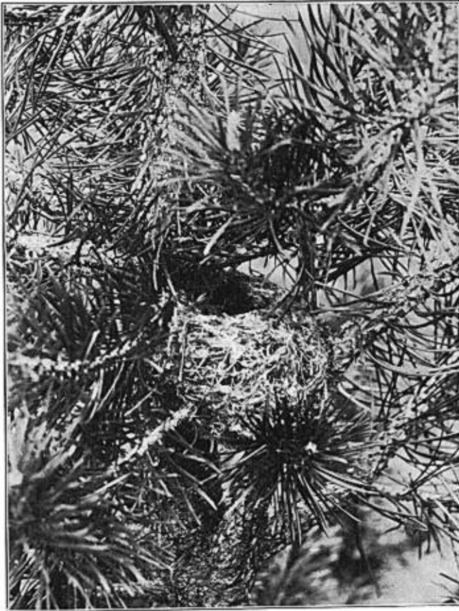
Fig. 42. NEST, in situ, OF THE RUBY-CROWNED KINGLET; NEAR LAKE TAHOE

By daybreak on May 30 I was on the road for the trip to Cave Rock and back. A tramp of 20 miles takes up the best part of a day to say nothing of the stops en route incidental to the study of ornithology. Near Edgewood two nests of the Western Robin were found which will illustrate the wide variation in nesting dates which I have found to prevail in the Sierras as it does almost everywhere,