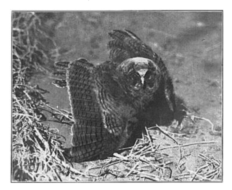
Fig. 13. YOUNG LONG-EARED OWL, PHOTOGRAPHED NEAR HOOPER, COLORADO

Asio wilsonianus. Long-eared Owl. At our camp at a deserted ranch, just outside the town of Hooper, Durand found the dead bodies of one adult, apparently a female, and three young Long-eared Owls, and one living young bird, the latter perched in a tree; it was able to fly. I secured several photographs of it, all taken