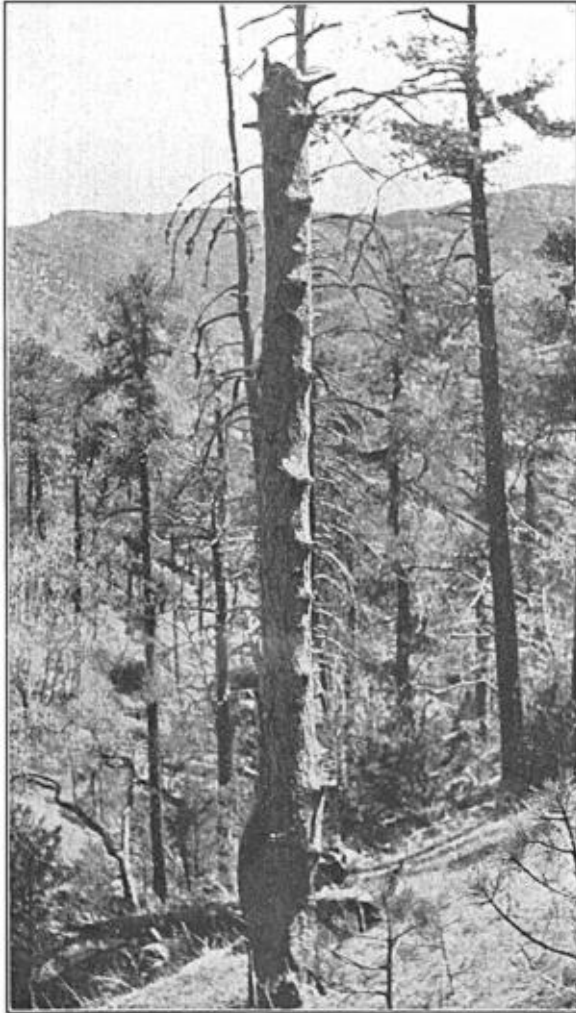
NESTING SITE OF FLAMMULATED SCREECH OWL; NEST IN SECOND HOLE FROM TOP OF STUB

I was looking for Otus flammeola , one of the most desired species on aforesaid list. As I reached my hand into an old Flicker's hole and touched a bunch of feathers a premonitory thrill made me feel sure my quest was successful. Enlarging the opening somewhat I was able to reach under the bird and felt eggs. On bringing the bird to view I was jubilant to find my premonition correct, and slipped her between the buttons of my shirt. Her claws, as she climbed toward my neck, made