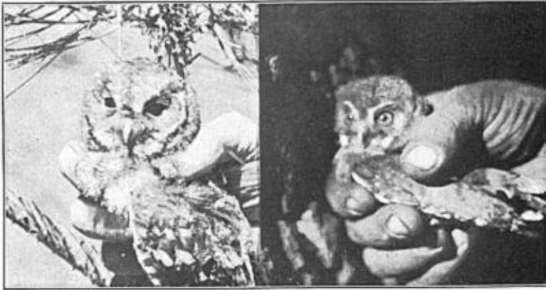
FLAMMULATED SCREECH OWL (AT LEFT) AND PIGMY OWL (AT RIGHT), SHOWING DARK-COLORED EYES OF FORMER

most striking feature to me was the mild look of her face, which appeared very different in aspect from that of other owls I had met with. Presently I discovered that this was due to the eyes, which, instead of having a yellow iris as in other owls, were a dark chocolate brown. Dr. Coues makes no mention of this feature, and I