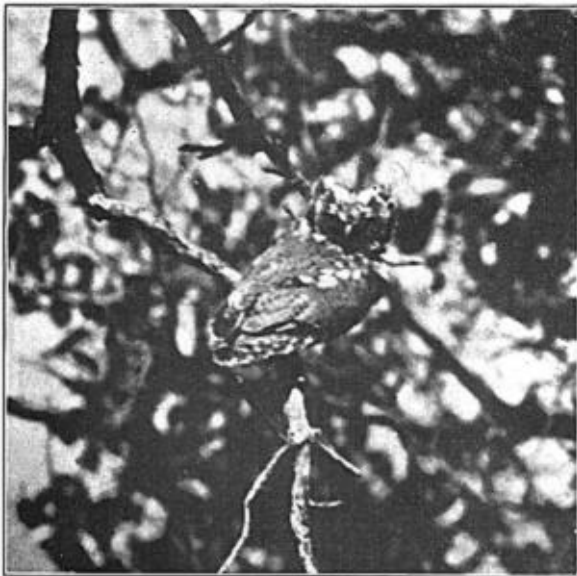
FLAMMULATED SCREECH OWL; NOTE BLUNTNESS OF PLUMICORNS

do not know whether it is included in any description as yet. The photograph shows this very plainly, the difference being easily noticed when compared with the Pigmy Owl shown in the picture to the right. The photograph also shows the stubbiness of the plumicorns.