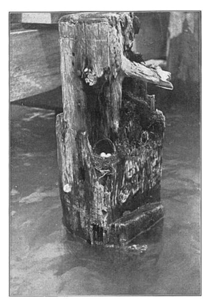
NEST OF BREWER BLACKBIRD ON PILE AT LAKE TAHOE

almost invariably bordering streams, swamps or boggy meadows. This year (1909), my fifth season in the region, they were as abundant as ever, and more so than usual about Bijou. Here there were half a dozen colonies along the meadows and lake shore, with from about ten to thirty pairs in a colony. Altho the altitude is high here (6220 feet) the birds nest quite early, and while the majority begin to lay about the middle of May, yet, as is usual where birds nest in large numbers, some nests were found with fresh eggs as late as early June.