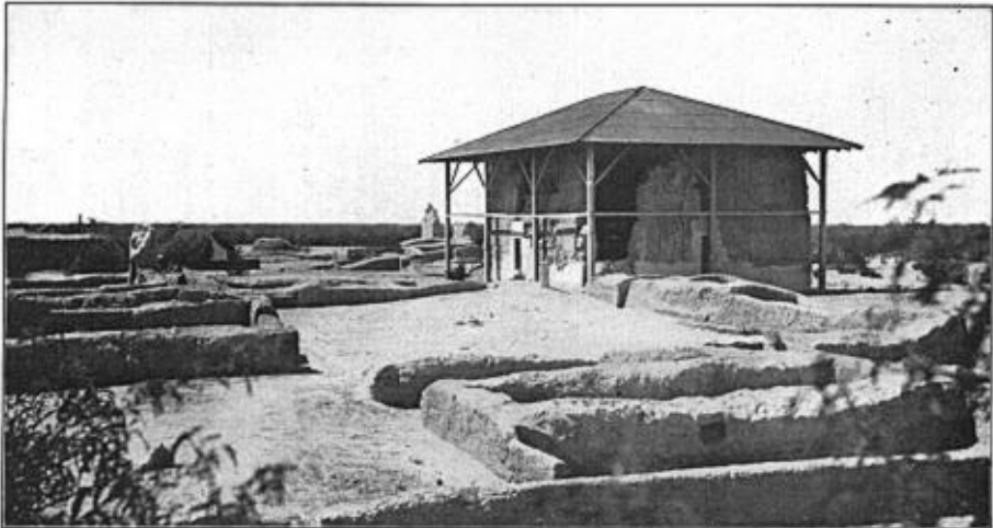
CASA GRANDE RUINS WHICH A PAIR OF WESTERN HORNED OWLS MADE THEIR HOME FOR SEVERAL YEARS

The Spotted Screech Owl is rather numerous, living in natural cavities and Gilded Flicker holes in cottonwood and willow trees. The Indians would give me no name for this owl; one man said it had a name but he had forgotten it; another lookt puzzled and said he thought it had a name but he had never heard it. They all knew the bird however. The Screech Owl I believe is responsible for the disappearance of many of the smaller birds, and some of the larger ones. I have frequently found feathers in their nests, and last year saw remains of a Bluebird and an Oriole in one of their nests. Woodpeckers frequently fall victim as I have found remains of the Gilded Flicker, and Gila and Texas Woodpeckers in and near their nests and