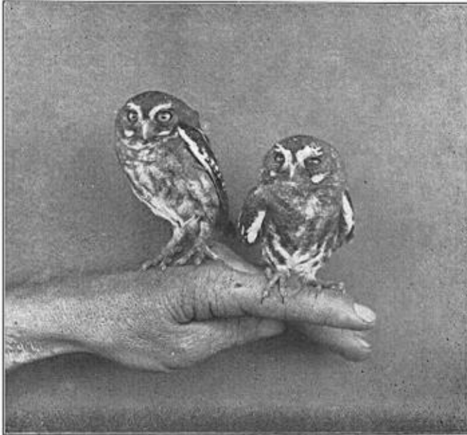
ADULT PAIR OF ELF OWLS

When the hand was withdrawn the owl came along quite easily. One claw was thru the nail of my little finger, another imbedded in big finger, while her beak was thrust deep into my thumb. Blood was running from all three wounds, and the bird hung on like a bulldog. It took no little diplomacy to remove her without forming an entangling alliance with the other hand, but she was finally safe in a handkerchief. I will back one of these owls in a rough and tumble fight with any-