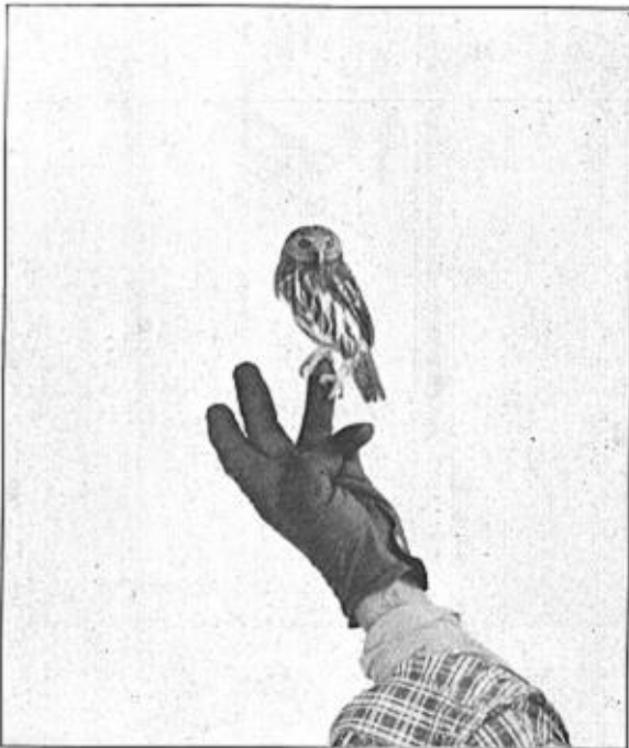
AN ADULT FERRUGINOUS PIGMY OWL

Burrowing Owls, or, more properly, Ground Owls, are rare in this immediate vicinity, tho said to be more numerous on down the Gila river. I have seen only four here; one was dug out of a hole on the school farm by Indian boys; and another flew up in the face of my team one evening nearly causing a runaway. The Pimas call this owl Kau-kau-hä'.