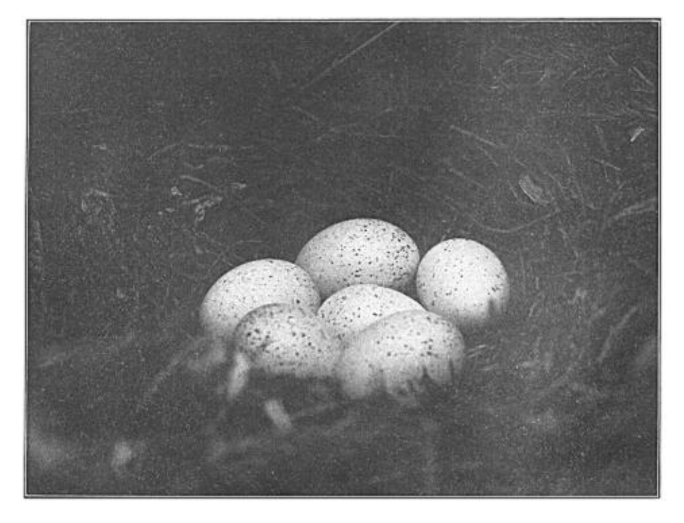
NEST AND SET OF SIX EGGS OF THE CALIFORNIA BLACK RAIL, LOCATED NEAR SAN DIEGO, APRIL 8, 1909

The whitish eggs have a scarely perceptible tinge of pink. They are finely speckled with bright reddish-brown and obscure lilac dots. The average measurement of the eggs is .95x.71 inches. The eggs exhibit great variations in size and shape but are rather uniformly markt. I believe the eggs of this species could not be mistaken for those of any other bird. The shells are of close-grained hard texture. They possess greater durability than any eggs of similar size that I know