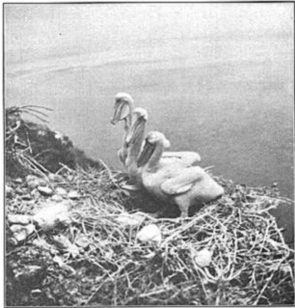
TYPICAL NEST AND YOUNG OF CALIFORNIA BROWN PELICAN

Pelecanus californicus. California Brown Pelican. During our stay we called on what we had supposed, the first morning at South Island, to be a colony of pelicans; it proved to be better than we expected, being a large colony of pelicans and cormorants combined. It was impossible to estimate the number of nests on the island, as they were very scattered and the island was steep and rugged. Several nests were found in which the eggs were so incubated that the young cried out from within their shells as they were handled, and a portion of the little bill protruded from the shell. The young are white when first hatch, but change to grey as soon as their feathers grow. However, until nearly full grown, much of their nest down remains. We noted that their colors were somewhat nest stained. They were very noisy and attempted to bite us as we passed, shooting their long bills out at us in a very comical fashion, their bills clicking like castanets. After the young are about half grown they gather in flocks and keep close together, probably for protection from their enemies. A queer action was that whenever they were hungry or frightened they disgorged their latest meals, which the gulls were not slow in putting away. For this reason the odor of this colony was frightful.