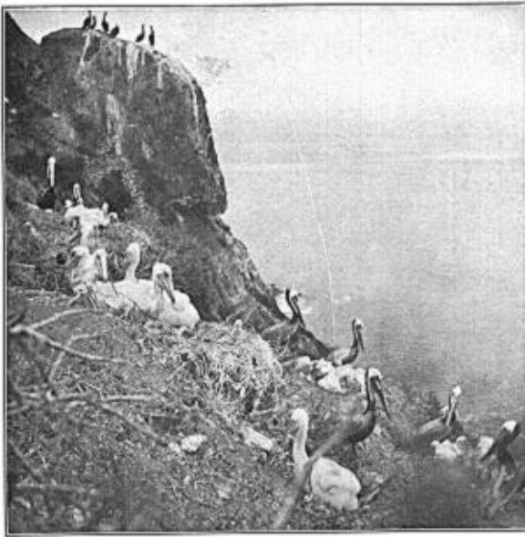
PORTION OF COLONY OF CALIFORNIA BROWN PELICANS ON SOUTH ISLAND

Brachyramphus hypoleucus. Xantus Murrelet. Only two seen—a female with a downy young, about two miles from shore. Several old nests were found with broken eggs, and two of them contained dead birds, killed probably by the cat which inhabits South Island.