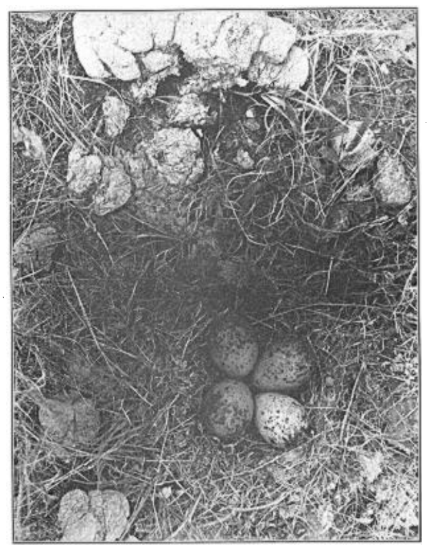
TYPICAL NESTING SITE OF THE LONG-BILLED CURLEW

IVEN: a man with a hobby; a box filled with cotton; a camera; and a bright day in the collecting season. Question: what will be the probable results? To the plain, matter-of-fact citizen, whose soul is bound by the chains of conventionality and commercialism, the problem seems impossible and well-nigh incomprehensible. In the first place he can not understand how a man,