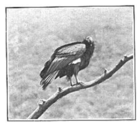
WITH FEATHERS RUFFLED UP AROUND HIS EARS

When we climbed around to the nest, we found the condor nestling had grown from the size of the egg, or from about a double handful, till he filled my hat. The