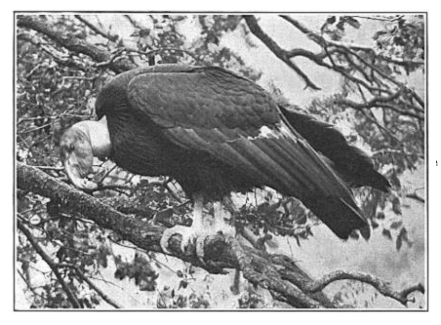
PERCHED IN AN OAK ABOVE THE NEST: ALTHO THE BIRDS WERE BIG AND HEAVY THEY PERCHED READILY IN A TREE AND CLIMBED FROM LIMB TO LIMB, OFTEN USING THE HOOKED BILL TO HELP THEM

Early the next morning we found one of the birds, presumably the male, and the intruder gone, while the other still sat on the tree-perch. About noon the father appeared in the eastern sky. The mother saw him first and we were attracted by her watching. We were surprised again to see the third bird following a little in