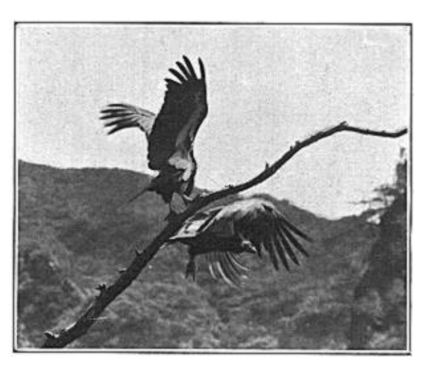
ONE CONDOR BECAME TOO AMOROUS AND CROWDED THE OTHER OFF THE PERCH

When we stooped to look at the nestling in the cave, he jumped right out at us. He was in a savage mood. If his mother would not stay to defend him, he intended to fight for himself. I could see that he was developing good fighting qualities. His mother might have showed fight too, if she were cornered as he was.