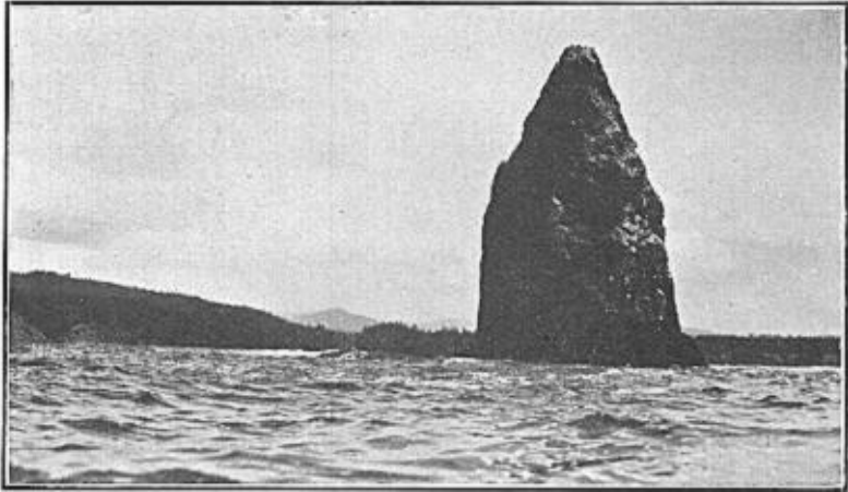
A WHITE-CRESTED CORMORANT ROOKERY; QUILLAYUTE NEEDLES RESERVATION

All the islands between Gray's Harbor and the Straits of Juan de Fuca are cov-