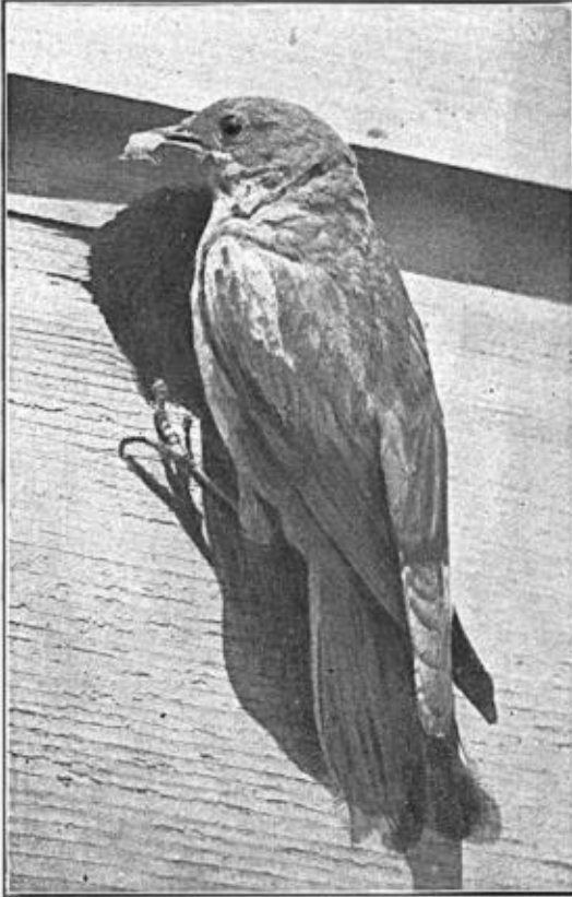
WESTERN BLUEBIRD ABOUT TO ENTER HOLE IN SIDE OF TANK-HOUSE, WITH FOOD FOR YOUNG

The nest was lined with horse-hair and once when the mother fed one of the chicks, the food caught and the little bird swallowed the hair too, but both ends stuck out of his mouth. He kept shaking his head, but could not get rid of it. I waited to see if