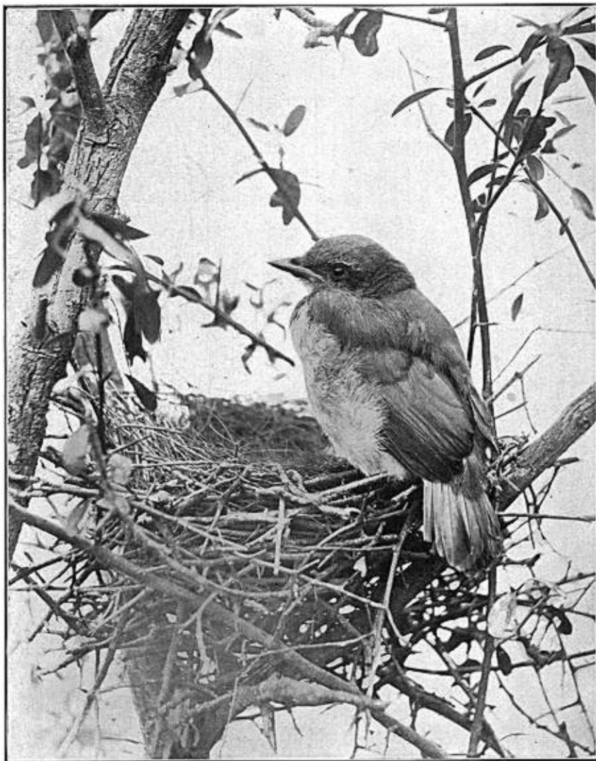
NEARLY FULL-FLEDGED CALIFORNIA JAY ABOUT TO LEAVE HOME