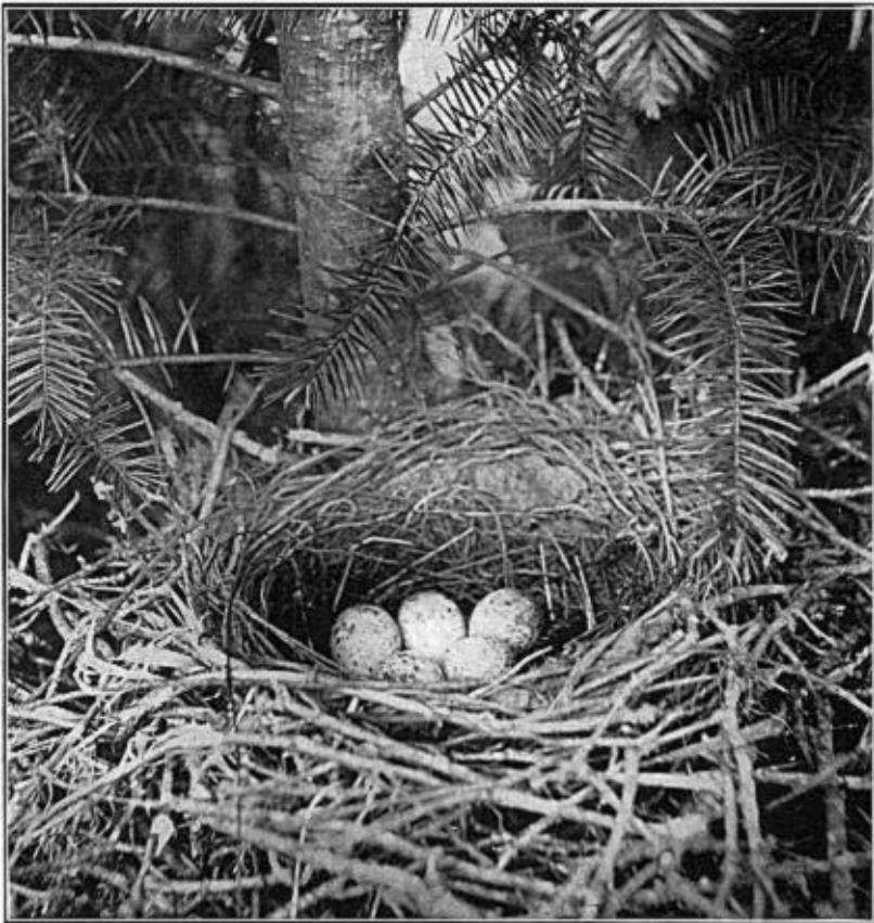
NEST AND EGGS OF THE STELLER JAY IN FIR TREE

If this pair of jays carried on their nest robbing, they did it on the quiet away from home, for in the thicket and only a few yards away I found a robin's nest with eggs, and the nest of a thrush with young birds. Perhaps the jays wanted to