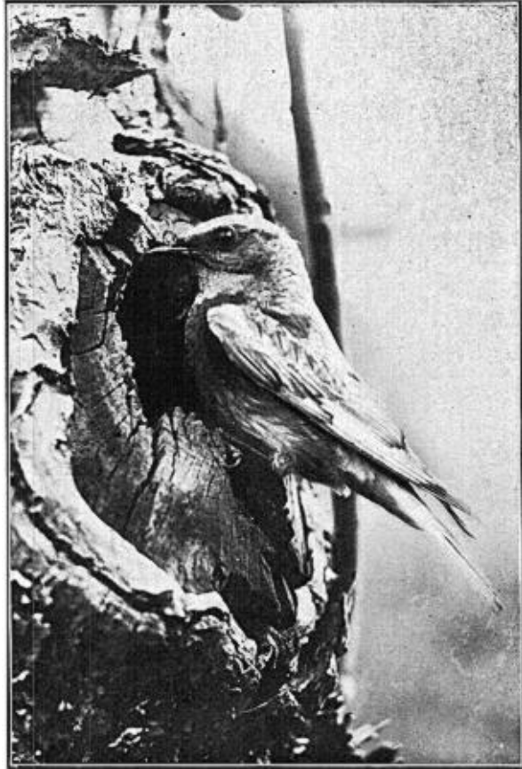
MALE WESTERN BLUEBIRD AT NEST-HOLE IN APPLE TREE

One of the young birds was very enthusiastic in helping her mother. Several times when the latter brought food, the young bird flew at her and tried to take the morsel she had in her mouth, as if saying: "Let me feed the children." And twice I saw the mother yield and let her older child feed the younger ones. It was a very pretty bit of bird life to watch these bluebirds. We were anxious to get a photograph of the mother and the young bird