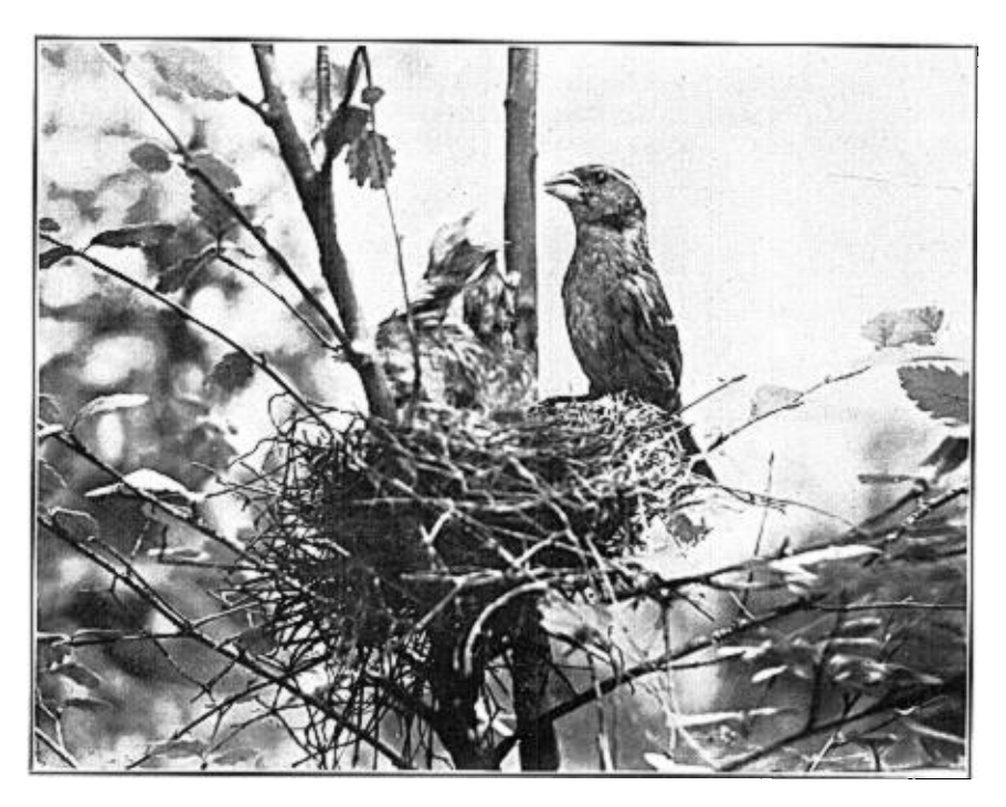
FEMALE GROSBEAK AT NEST

The parents fed their bantlings as much on berries as on worms and insects. Once I saw the father distribute a whole mouthful of green measuring worms. The next time he had visited a garden down the hillside, for he brought one raspberry in his bill and coughed up three more. Both birds soon got over their mad anxiety every time we looked at the youngsters. In fact, they soon seemed willing enough