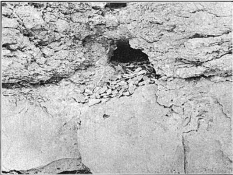
ROCK WREN NEST IN CLIFF