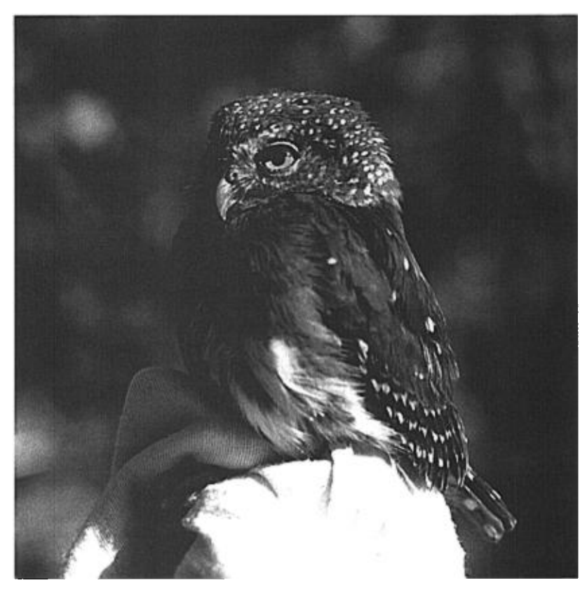
FIG. 1. Adult male Glaucidium nubicola from Alto de Pisones, Colombia (ICN 31200). Note the mininal or complete lack of pale spotting or barring on the back, sides of the chest, and flanks that distinguishes this species from the similar appearing G. costaricanum , G. jardinii , and G. bolivianum .

three additional specimens of the new South American taxon, all identified as nominate jardinii , in North American museums.