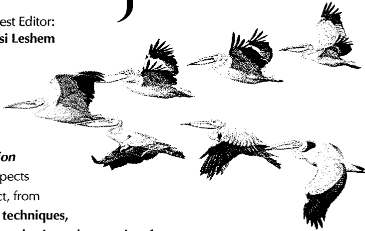
flight sequence of white pelicans James P. Smith 1993