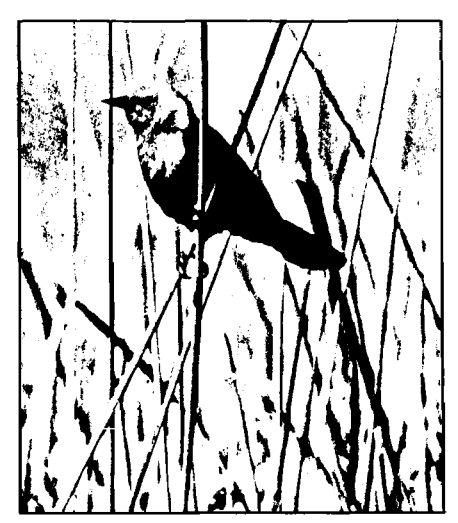
WRITE FOR OUR POPULATION BIOLOGY AND ORNITHOLOGY BROCHURES.