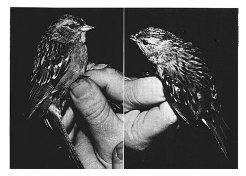
Fig. 1. Apparent hybrid Zonotrichia atricapilla \times albicollis, caught and photographed on 12 January 1978.

Center. Wing length of 20 male and 20 female Z. atricapilla in the University of Michigan Museum of Zoology collections averages 78.2 \pm 2.8 \text{ mm} (SD) (range 72-83 mm), and wing length of 20 male and 20 female Z. albicollis from Michigan averages 70.9 \pm 3.0 \text{ mm} (range 65-76 mm). The Michigan bird was smaller than almost any Z. atricapilla but was near the mean (72.6 mm) of male Z. albicollis. Tail length was midway between the shortest Z. atricapilla (range 73-83 mm) and the longest Z. albicollis (range 67-81 mm).