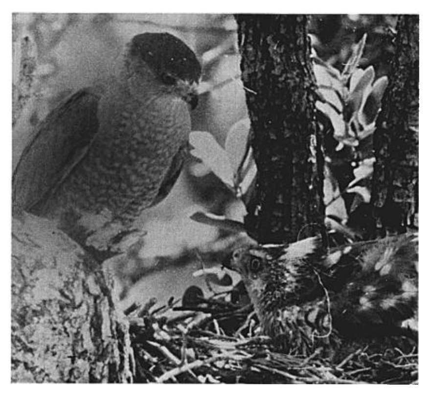
Fig. 5. Female Cooper's Hawk displaying the occipital region upon the male's arrival at the nest. Sunlight may enhance the spot in this photograph.

social signal associated with crest erection. All evidence gathered to date supports this proposal.