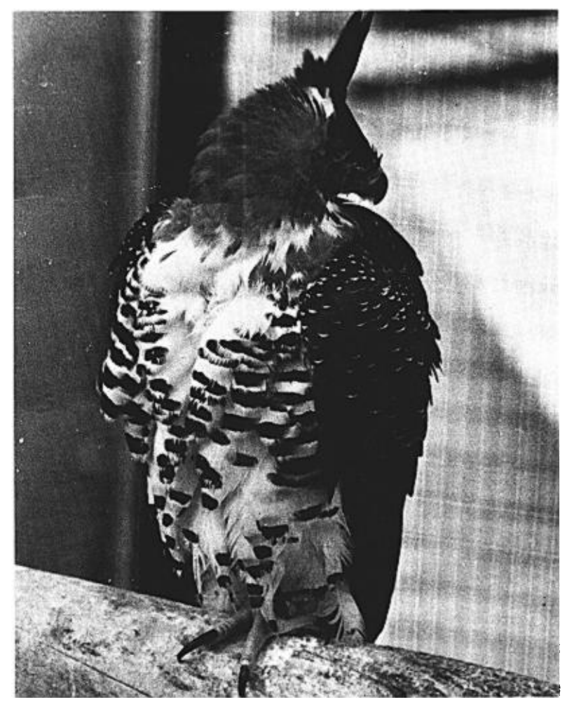
Fig. 4. The Ornate Hawk-Eagle (Spizaetus ornatus), among others, shows the white occipital spot each time the crest is erected.

genera, Haliastur and Gypaetus, have no spot in any plumage, but these genera have pale-colored heads in the adult plumage similar to that of the New World Leucopternis. Gypohierax has the spot in only the dark-headed juvenile plumage, the white head of the adult exhibiting no apparent spot. The three vulturine genera examined, Necrosyrtes, Gyps and Aegypius, being "naked-headed," lacked the occipital spot. Lastly two Old World genera of accipitrids, Harpyopsis and Pithecophaga, lacked the spot.