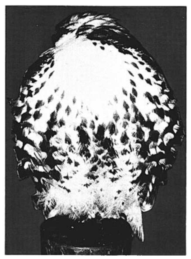
Fig. 7. Sleeping Red-tailed Hawk exhibiting the deflective facial disc.

human-imprinted birds. Hamerstrom and Hamerstrom (1972) report that during a sexual display, the male Red-tailed Hawk faces away. It is interesting to note that the bird "faced away" as he would be properly positioned to exhibit the spot. Frances Hamerstrom (pers. comm.) describes a captive female Red-tailed Hawk that flattened low in the nest and displayed the white occipital spot each time the male approached the nest. Helen Snyder (pers. comm.) similarly reports that the wild female Cooper's Hawk, when brooding eggs, erects the crest upon the male's arrival at the nest (Fig. 5). It seems apparent that the frontal stare is a signal of aggression, which is apparently appeased by the display of the spot. Such an appeasement gesture would logically precede any transfer of food from male to female at the nest site. Lastly the spot appears to be a significant social signal among nestlings of A. cooperii. Snyder further reports a strong back-turning response during conflict between siblings of this species and states that during this sort of struggle over prey, the crest is erected and the back of the head shows white in both sexes.