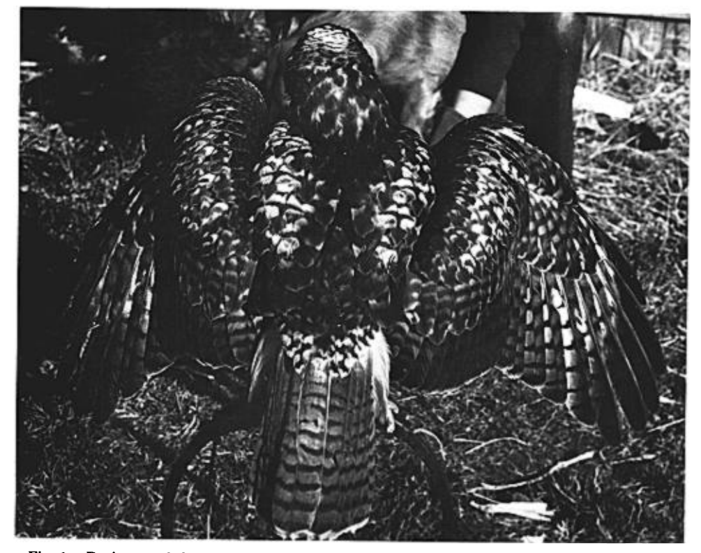
Fig. 6. During agonistic encounters, the spot of the Red-tailed Hawk is exposed to the rear and may function in deflection.

cal aggression. The accipitrid spot appears to be such a character. Helen Snyder (pers. comm.) working with Cooper's Hawks ( Accipiter cooperii ) reports that showing the back of the head, and concomitant display of the white spot, cause immediate behavioral inhibition on the part of the aggressor in this species. The red patch at the back of the head of young Water Rails, Rallus aquaticus (Lorenz 1952: 195), and the cryptic white of the White-necked Raven, Corvus cryptoleucus (Johnston 1958) are reported to be signal organs with this function.