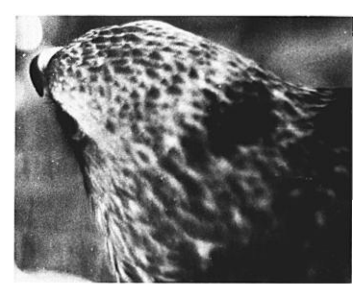
Fig. 2. Red-tailed Hawk showing the terminal darkening of the occipital spot feathers.

definitive spots while many Old World species exhibit poorly developed, possibly vestigial spots. Of the New World taxa examined, all had occipital spots except Leucopternis and the cosmopolitan Elanus . These two genera have pale heads in adult plumage, perhaps explaining the absence of the spot (see below). Four other genera, Elanoides, Busarellus, Harpia , and the cosmopolitan Haliaeetus have the spot in only the dark-headed juvenile plumage; the spot is not apparent on the pale-colored head of the adults.