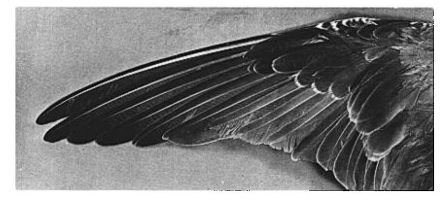
Fig. 2. Wing from Wandering Tattler 3. Primaries 2, 3, and 4 are very worn and faded juvenal feathers; all other primaries are new. The pattern of primary replacement is unusual and commences with feather 6 (see text). The juvenal primaries seen here typify the appearance of similar feathers in Whimbrels, curlews, and turnstones.

Golden Plover.—Based upon the condition of primaries, each specimen fell into one of three groups: (1) Primaries showing no wear, bright brown-black in color (Fig. 1a), one bird with no primary molt occurring, two with primary molt underway (specimens 1, 11, and 12, respectively, Table 1). (2) Primaries slightly worn and faded at the tips, some birds were not molting primaries, others were (specimens 2 and 3, 4–10, respectively, Table 1). (3) Tips and edges of primaries moderately worn and faded (Fig. 1b), all birds in primary molt (specimens 13–17, Table 1). The tertials in each of the three groups were a mixture of worn, faded feathers plus brighter more recently acquired plumage. Brightly colored tertials were more abundant in birds from groups 1 and 2 as compared to group 3 specimens.