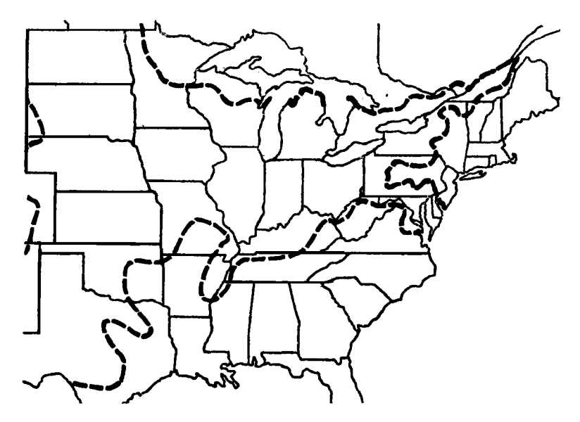
Fig. 2. 1972 breeding distribution of the Prairie Horned Lark (compiled from the breeding bird surveys, 1967-72).

Dickcissels were considered extremely rare in Washington, D.C. by 1875 (Richmond 1888).