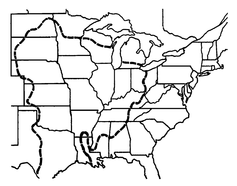
Fig. 4. 1972 breeding distribution of the Dickcissel (compiled from the breeding bird surveys, 1967–72).

In New England forests were cleared for agriculture until the amount of cleared land reached about 80% of New England's total land area between 1820 and 1850 (Bromley 1935). Although much of this later reverted to second-growth forest, the Horned Lark's movement across New York state and into New England in the late 19th century may have been in response to the removal of forests.