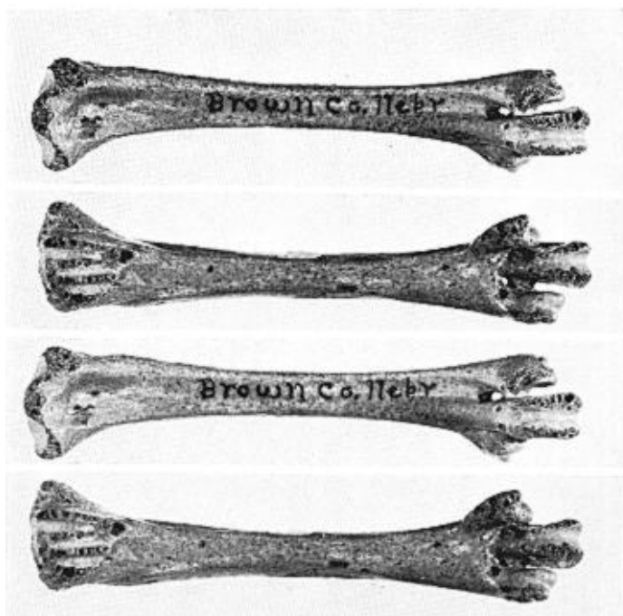
Figure 1. Heterochen pratensis , type left tarsometatarsus. Stereophotographs showing anterior view (set comprised of top, and third from top figures) and posterior view (set comprised of bottom, and third from bottom figures). Approximately natural size.

the external surface of the shaft; and, shaft flat and dropping steeply from internal tendinal canal to external ligamental prominence.