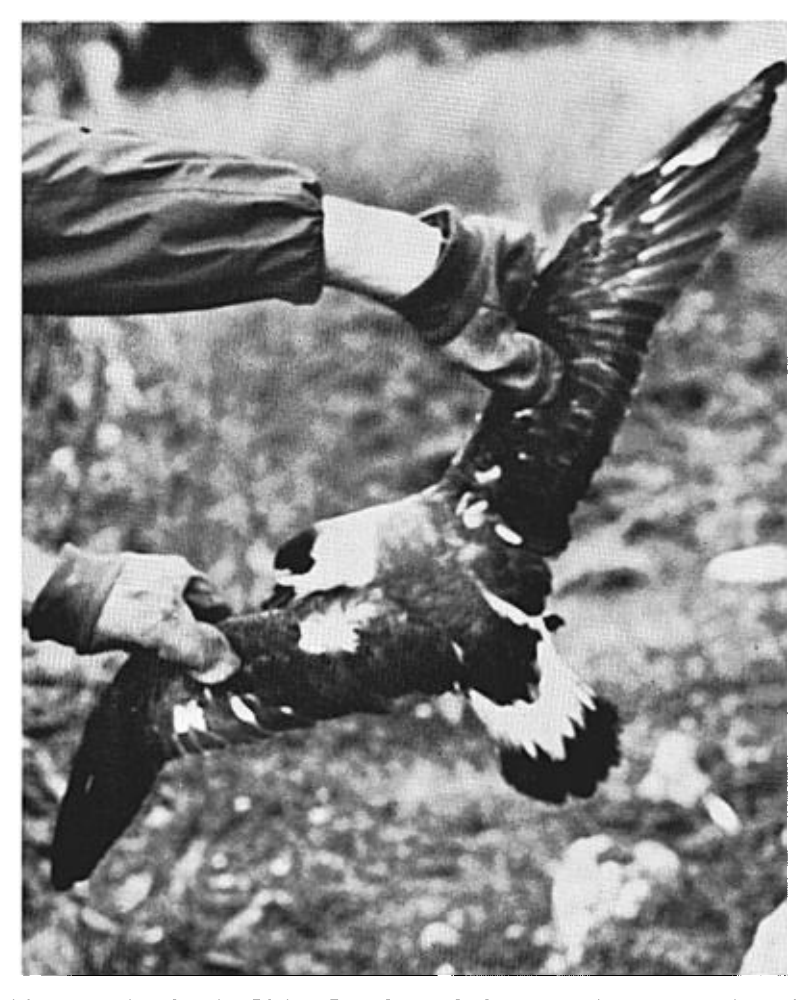
Figure 2. A (above). Living Pterodroma hasitata , dorsal aspect. B (opposite, top). Ventral aspect of the same bird. C (opposite, bottom). View to the east from Morne Cabaio. Tête Opaque in middle distance. The cliff shown is about 600 meters in height. Five petrel colonies occur in the section of cliff shown.

Estimating the number of colonies on Hispaniola was somewhat easier. This was done by calculating the ratio of occupied to unoccupied potential