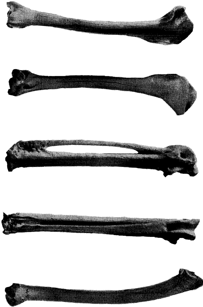
Figure 3. Gallinula brodkorbi . From top: (a) holotype, right humerus, anconal view, No. PB 16, actual length, 59.0 mm; (b) palmar view of holotype; (c) left carpo-metacarpus, medial view, No. PB 1825, actual length, 34.7 mm; (d) left carpometacarpus, posterior view; (e) right ulna, No. PB 1807, actual length, 45.8 mm.

ital crest, and distal end of shaft is less bowed in lateral view; differs from Porphyriops in greater rounding of internal condyle, external condyle relatively larger and set more obliquely to vertical plane of the shaft, and shaft much less bowed laterally. Differs from Gallinula chlo-