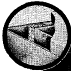
Air-Tight double walled construction