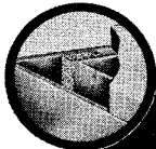
Air-Tight double walled construction