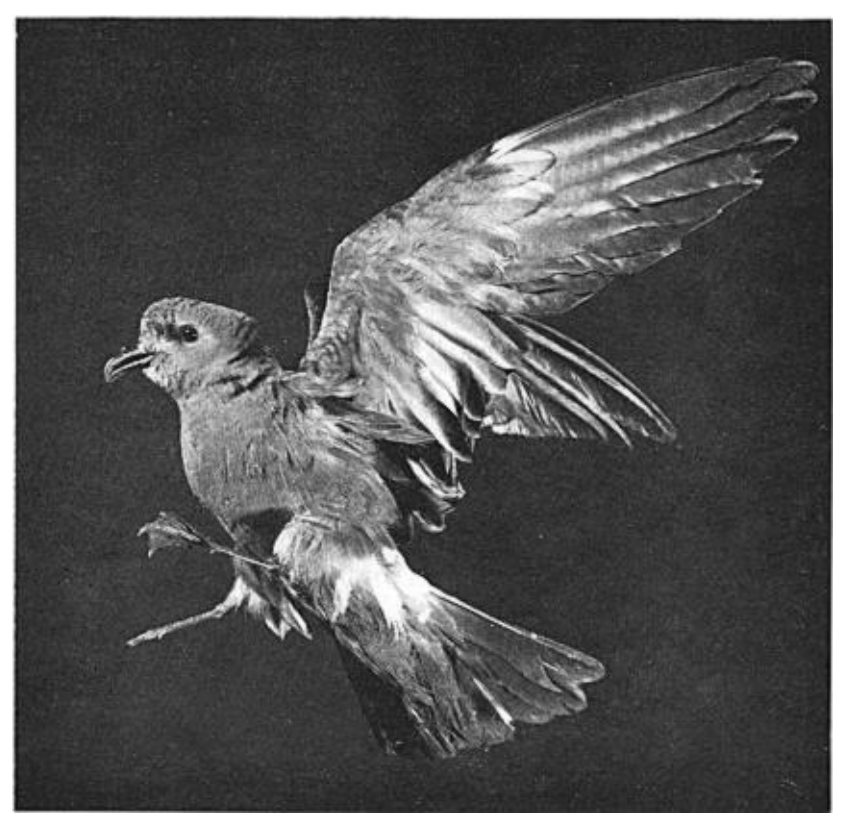
Leach's Petrel (Oceanodroma leucorhou) at Machias Seal Island, Maine, in July of 1953. The exposure was made indoors, using a Speed Graphic camera and a wet-battery-operated Dormitzer, operating 2 lights at 200-watt capacity and 1/5000 second flash duration.