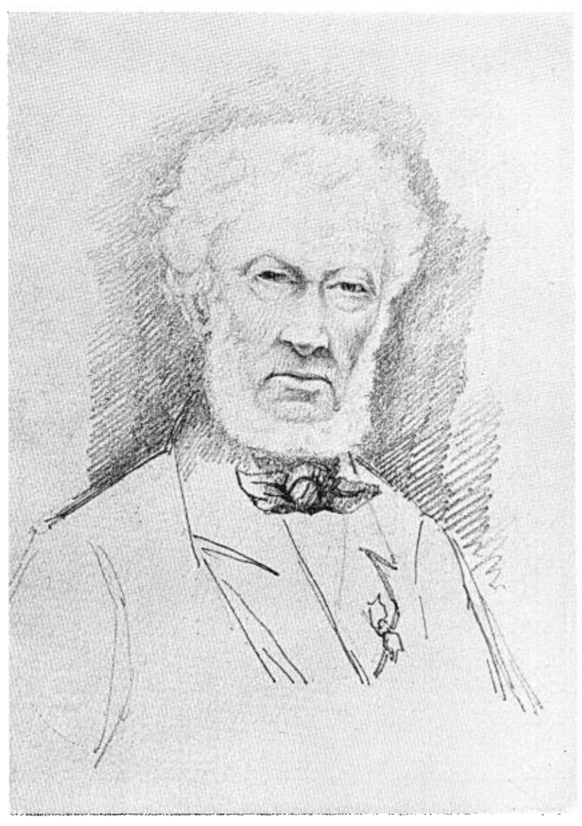
LAFRESNAYE (BARON FRÉDÉRIC DE LA FRESNAYE).

From a crayon sketch, through the courtesy of the Museum of Natural History of Nantes.