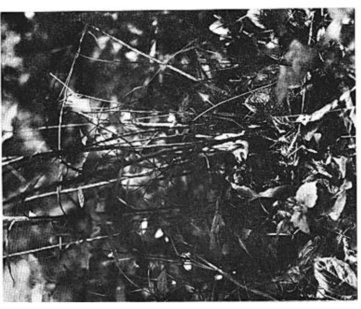
Brewster's Warbler at Nest, June 24, 1925. (Left) Feeding Young; Golden-winged Warbler in Upper Right Corner. (Right) Pausing After Feeding Young.