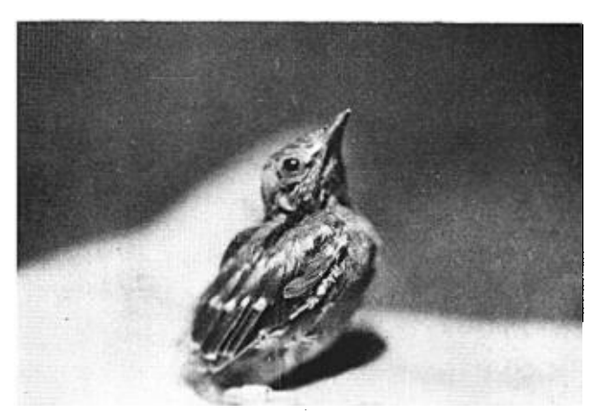
(Above) Adult Briwstir's Warmer while Scar on Head (see text). June 27, 1925. (Below) Young of Briwstir's J. Goldenwinged Warbler. June 10, 1922.