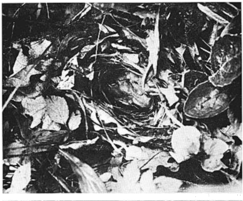
NEST OF BREWSTER'S AND GOLDEN-WINGED WARBLER: WITH EGGS, JUNE 14, 1925; WITH YOUNG, JUNE 21, 1925.