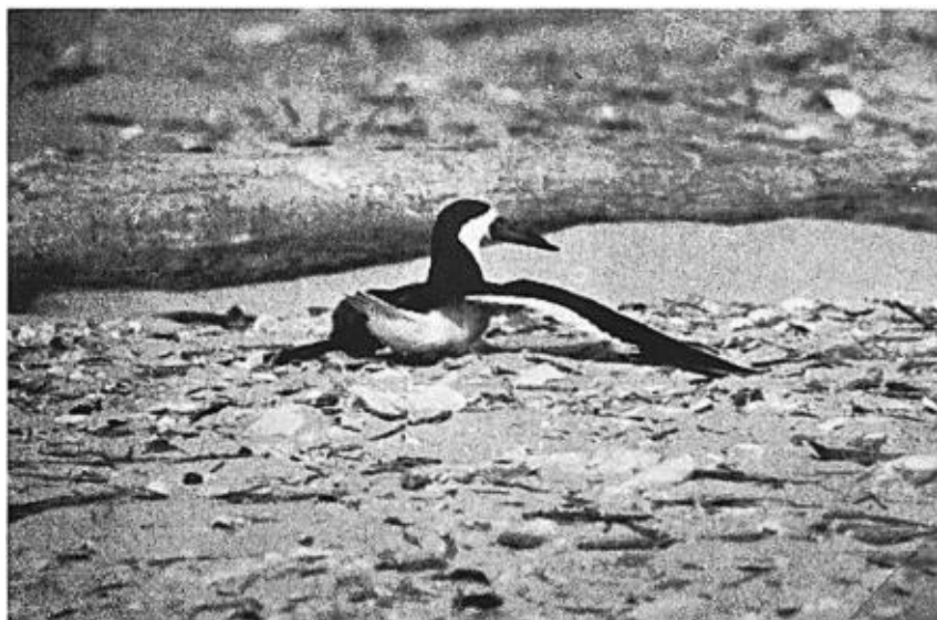
BLACK SKIMMERS FEIGNING INJURY IN THE VICINITY OF THEIR NESTS.