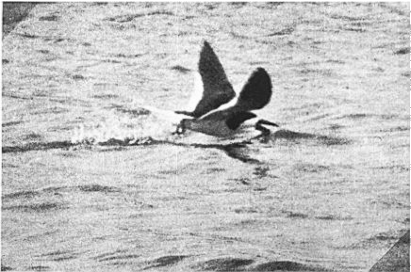
UPPER: YOUNG BLACK SKIMMERS BEING COVERED BY BLOWING SAND. LOWER: BLACK SKIMMER FEEDING IN A LARGE TIDE POOL.