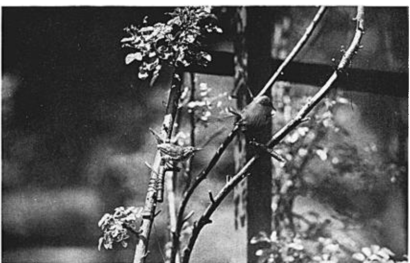
RESPONSE OF MALES TO MOUNTED BIRDS OF OTHER SPECIES.

Upper: Male Golden Pheasant Displays to Mounted Female Ring-necked; Ignores Mounted Male Golden.