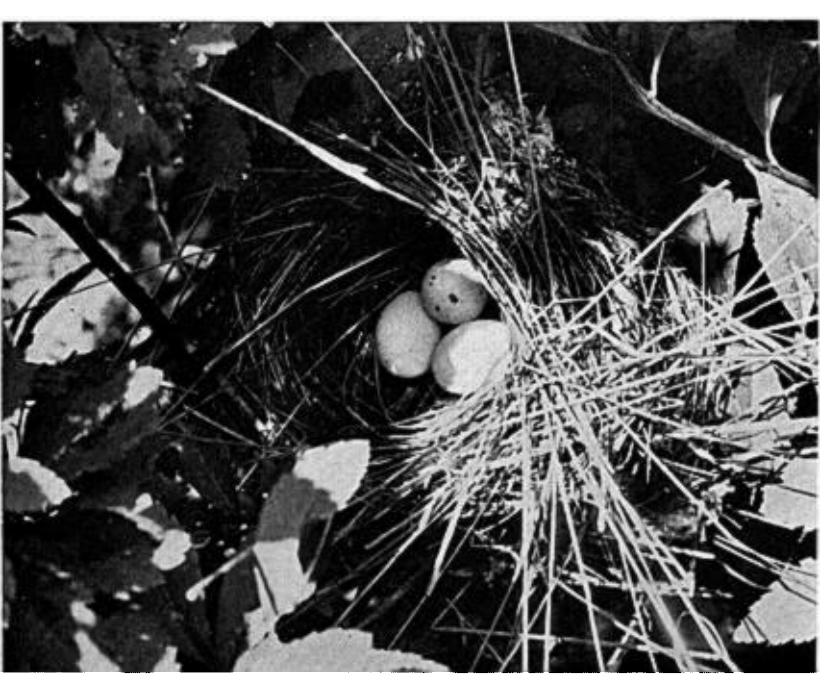
Left.—Nest and eggs of the Alder Flycatcher (Empidonax trailli trailli). Right.—Female about to feed young.