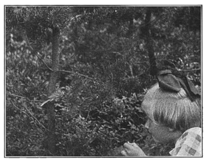
FEEDING THE KIETLAND'S WARBLER AT THE NEST.