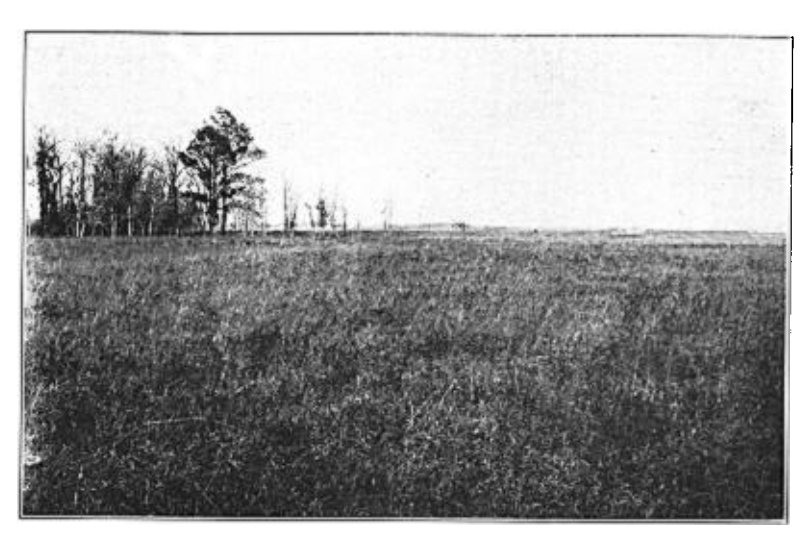
Between the Prairie and the Timberland, Coastal Region near Houston, Tex.