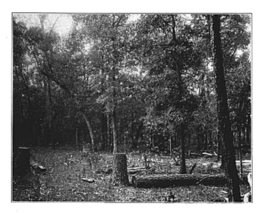
Mixed Oak and Pine Woodland on Buffalo Bayou, west of Houston, Tex.