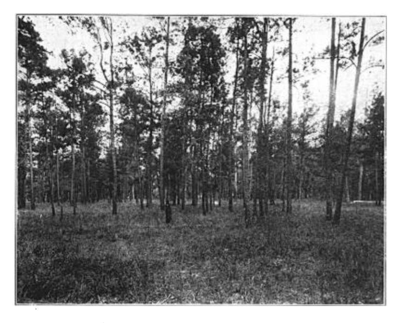
OPEN PINE WOODS ON BUFFALO BAYOU.