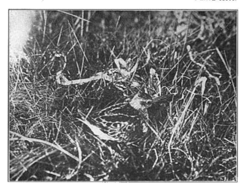
1. Adult Least Sandpiper, identifying nest concealed by Sticks.