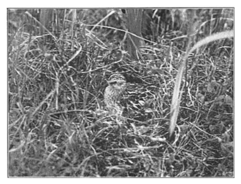
3. Adult Least Sandpiper, incubating. Unconscious attitude.