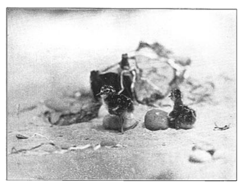
2. Young Least Sandpipers about three days old.