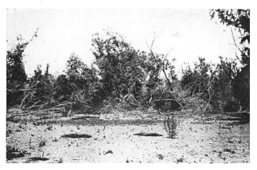
LAGOON IN THE COLORADO RIVER BOTTOMS NEAR NEEDLES, CALIFORNIA.