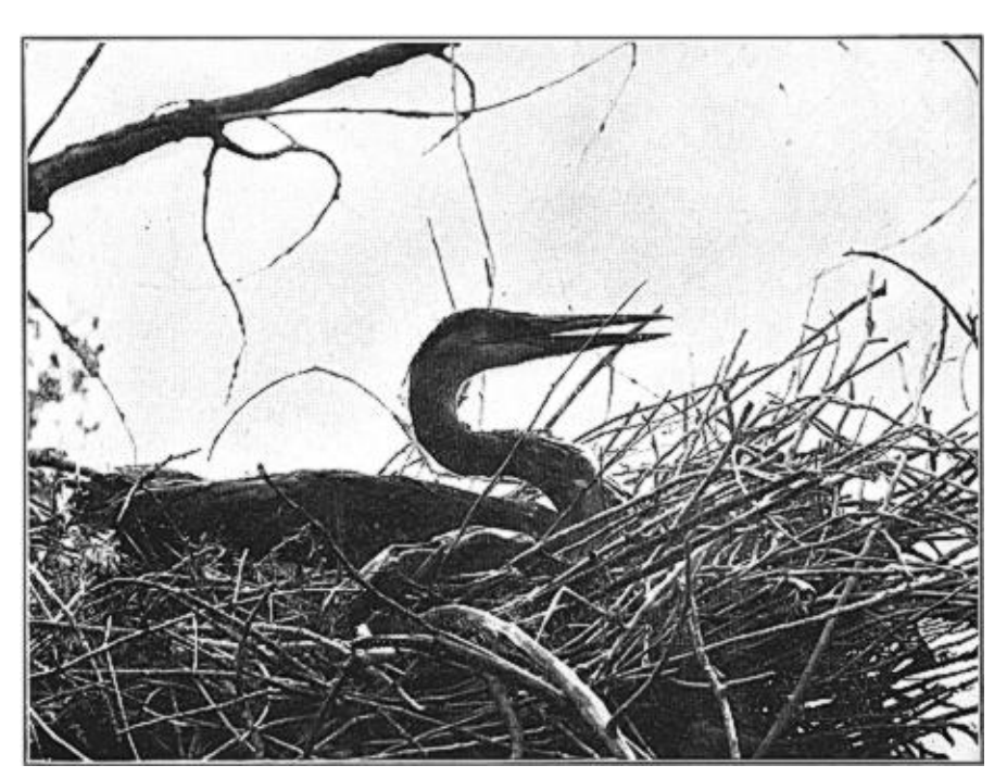
Fig. 2. -- Young Great Blue Heron, two months old.