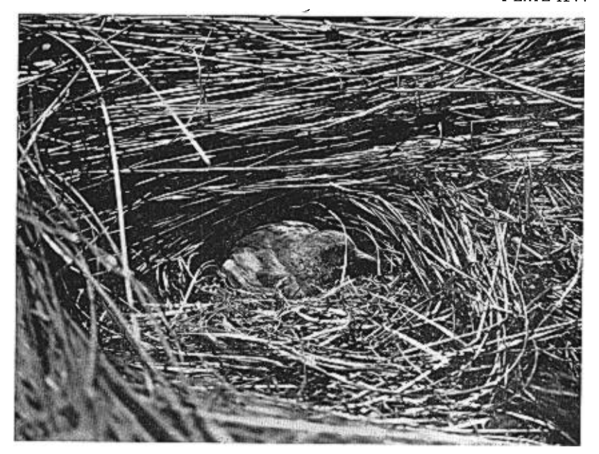
FIG. 1. LAYSAN RAIL ON NEST.