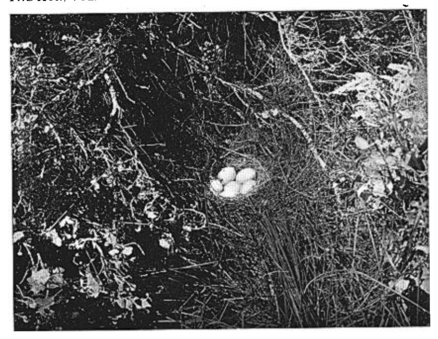
Fig. 1. NEST OF LAYSAN TEAL.