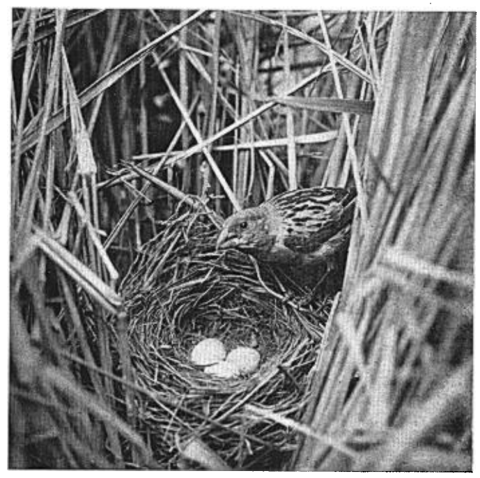
LAYSAN FINCH AND NEST.