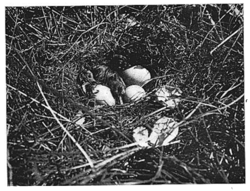
Fig. 2. YOUNG OF LAYSAN TEAL.