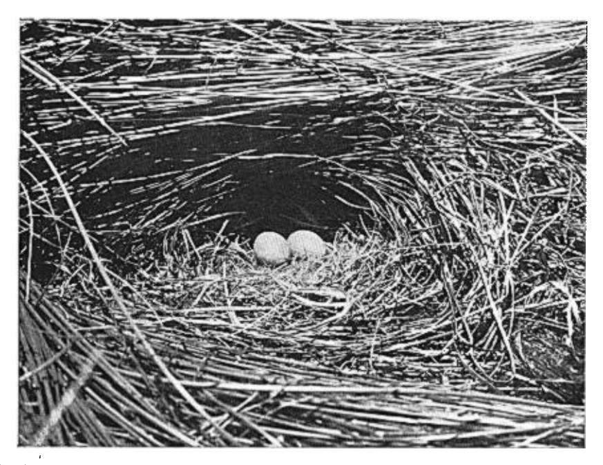
FIG. 2. NEST OF LAYSAN RAIL.