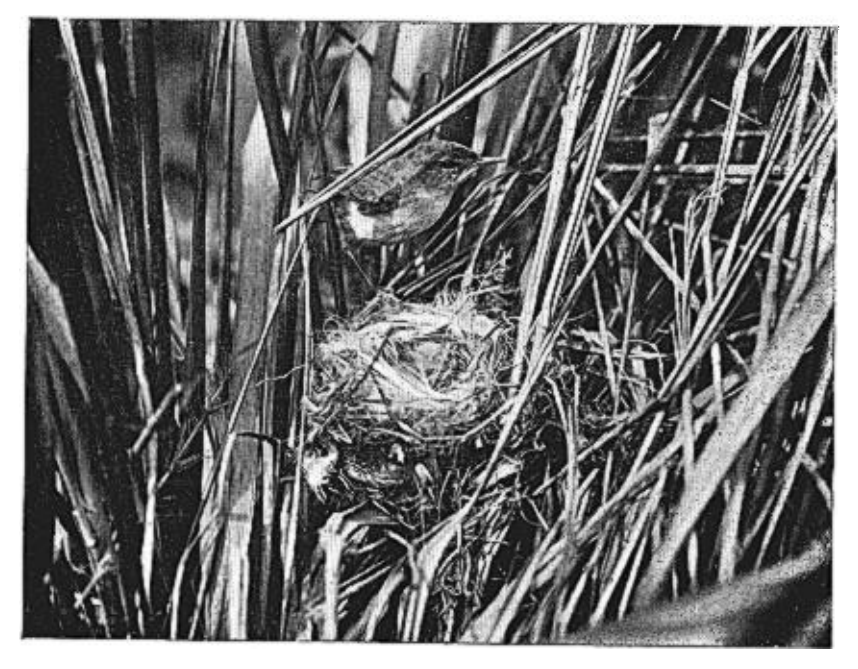
Fig. 1. ACROCEPHALUS FAMILIARIS AND NEST.