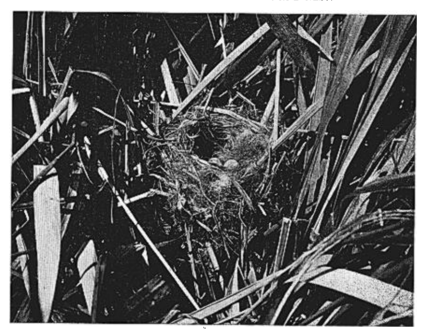
FIG. 2. NEST OF ACROCEPHALUS FAMILIARIS.