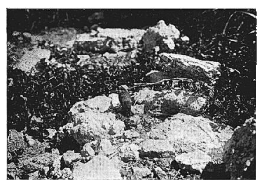
Fig. 2. LAYSAN RAIL EATING TERN'S EGG