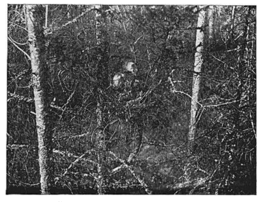
FIG. 2. CANADA JAYS FEEDING YOUNG.