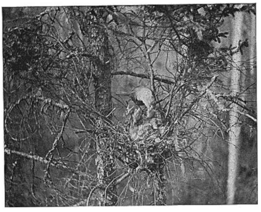
FIG. 3. CANADA JAY FEEDING YOUNG.