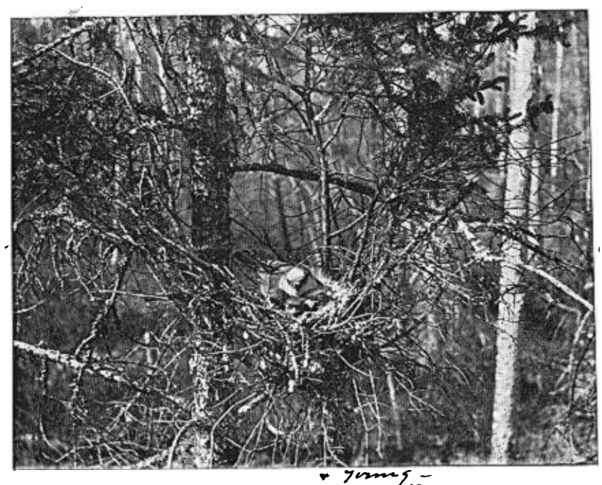
Fig. 4. Canada Jay Creamed Nest.