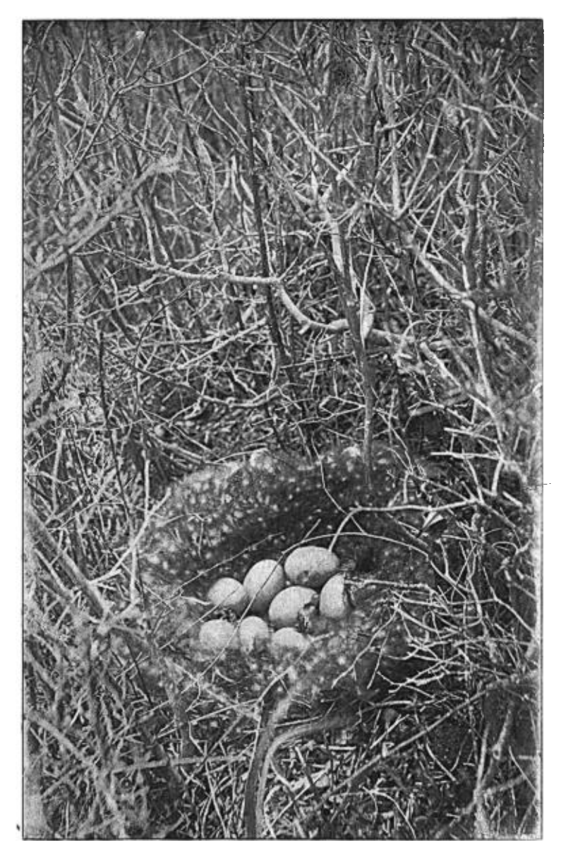
BLACK DUCK'S NEST, PLUM ISLAND, N. Y.