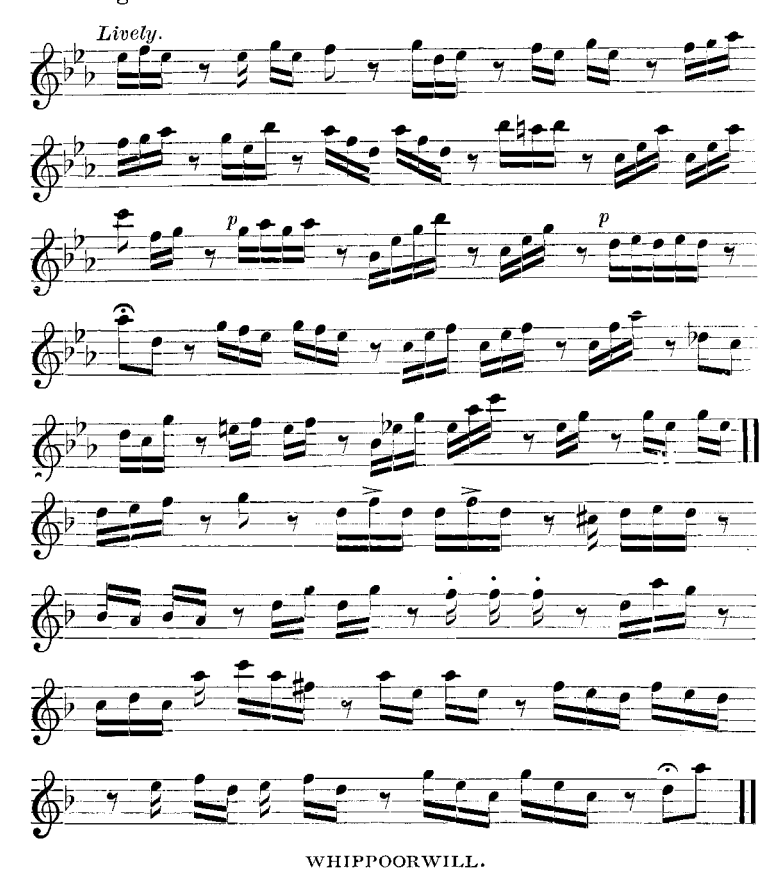
No bird in New England is more readily known by his song

of performance he is unsurpassed, unless it be by the Catbird. While prone to the conversational style, he is capable of splendid inspiration. On a fine morning in June, when he rises to the branch of a wayside tree, or to the top of a bush at the edge of the pasture, the first eccentric accent compels us to admit that the spirit of song has fast hold on him. As the fervor increases, his long and elegant tail droops, his whole plumage is loosened and trembling, his head is raised, and his bill is wide open; there is no mistake, it is the power of the god. No pen can report him now; we must wait till the frenzy passes. Then we may catch such fragments as these: