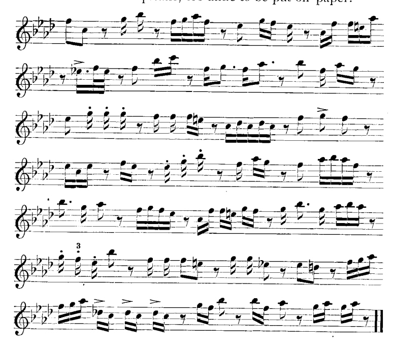
BROWN THRUSH; BROWN THRASHER.

With something of the style of the Brown Thrush, the Catbird is not his equal in song. He is generally considered a mocking-bird, and does make use of the notes of different birds, delivering them in snatchy, disconnected fashion. It is easy to trace in the Catbird's singing the notes of the Red-eyed Virco, the Brown Thrasher, Bluebird, Robin, and Yellow-breasted Chat. His performance on the whole is very interesting, given, as it is, in a lively manner, with an occasional tone truly sweet and musical. Much of his singing, however, is mere twitter, often little more than a succession of squeaks, too antic to be put on paper.