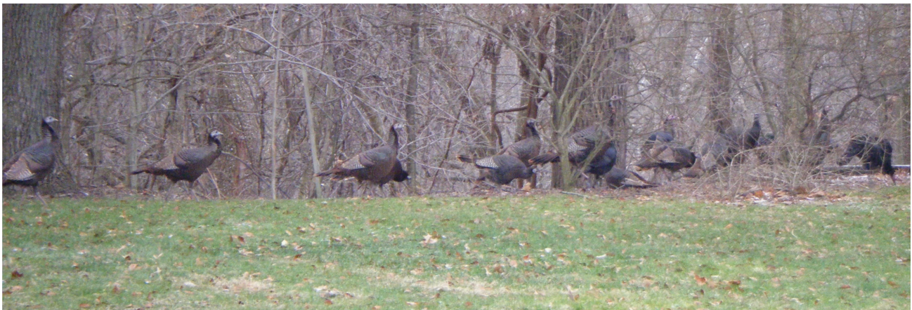
Wild Turkeys, Brecksville, 12-20-2008