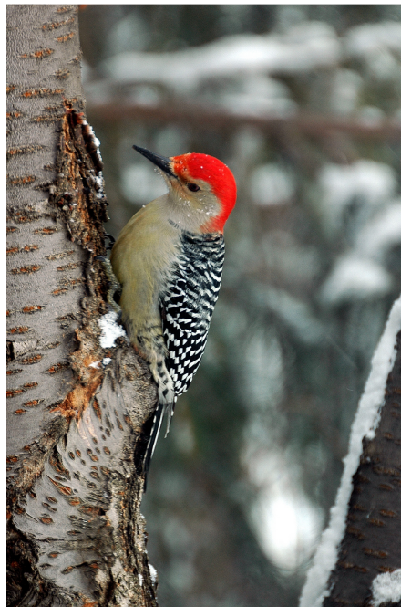
Red-headed Woodpecker, Brecksville, 2-19-2009