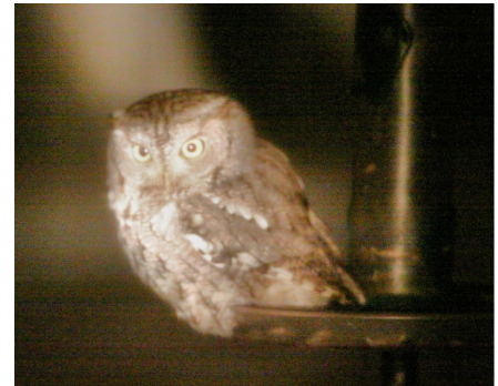
Eastern Screech-Owl, Bay Village bird feeder, 2-3-2009