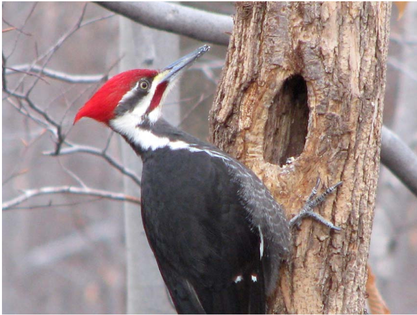
Pileated Woodpecker, North Chagrin Reservation, Cuyahoga Co., 2-15-2009