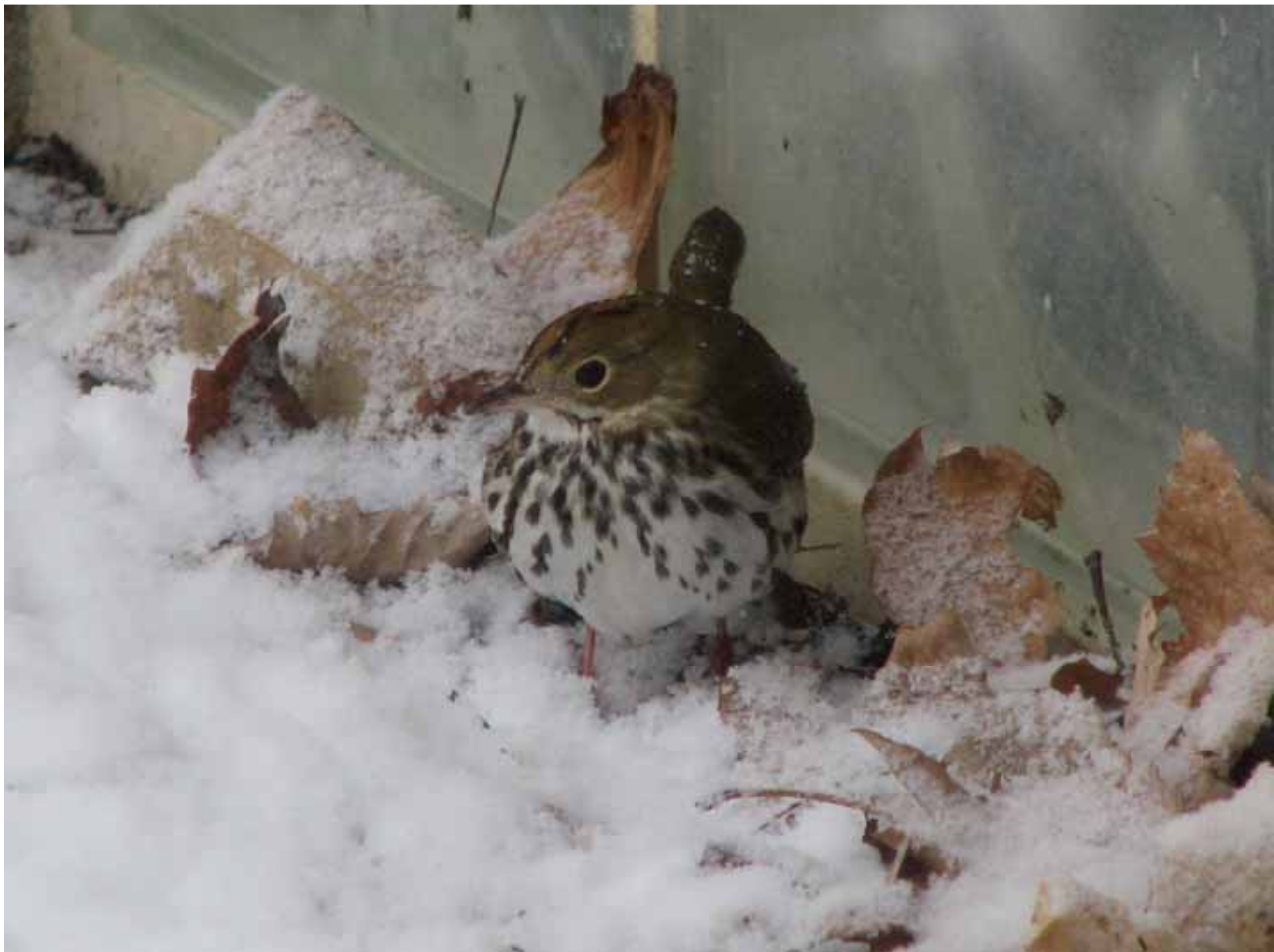
Ovenbird, Chardon, 1/20/2008 Sally Isacco

Song Sparrow. Ten were seen on 12/10 at Ira Road (TMR). On 12/16,