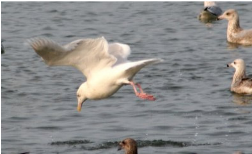
Glaucous Gulls, E. 72 nd Street, Cleveland, 12/31/2007