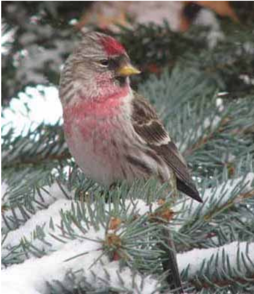
Common Redpoll, Chardon, 1/3/2008 Sally Isacco

six were counted along the Summit County Bike & Hike path at the junction of Rts. 303 and 8 (FL).