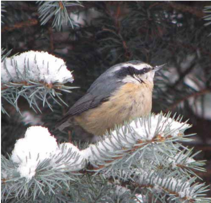
Red-breasted Nuthatch, Chardon, 2/11/2008