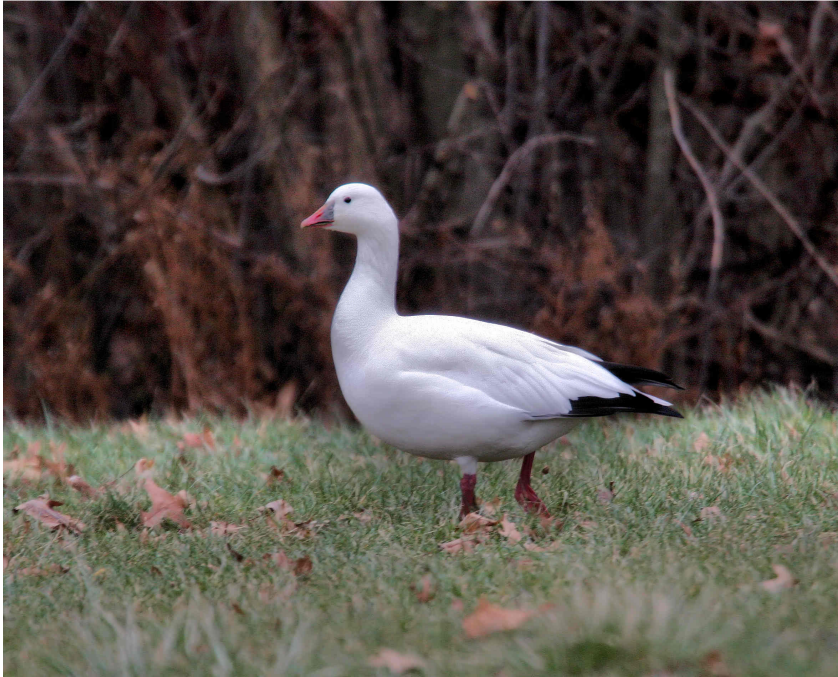
Ross's Goose, Olmsted Falls golf course, 12/29/2007

Noteworthy species, numbers, or dates are underlined>.