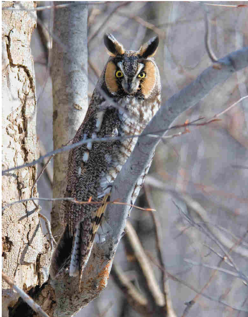
Long-eared Owl, A. B. Williams Woods, Cuyahoga Co., 12/21/2007