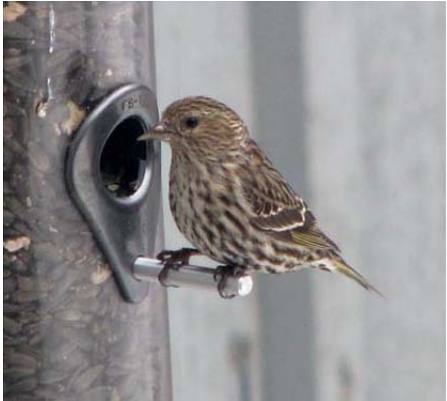
Pine Siskin, Chardon, 2/21/2008

House Sparrow. Thirty were counted along the Summit County Bike & Hike path at Rt. 303 and Rt. 8 on 12/16 (FL). Less rural, 171 were counted at the Brookside Park/Cleveland Zoo on 12/29 (TMR).